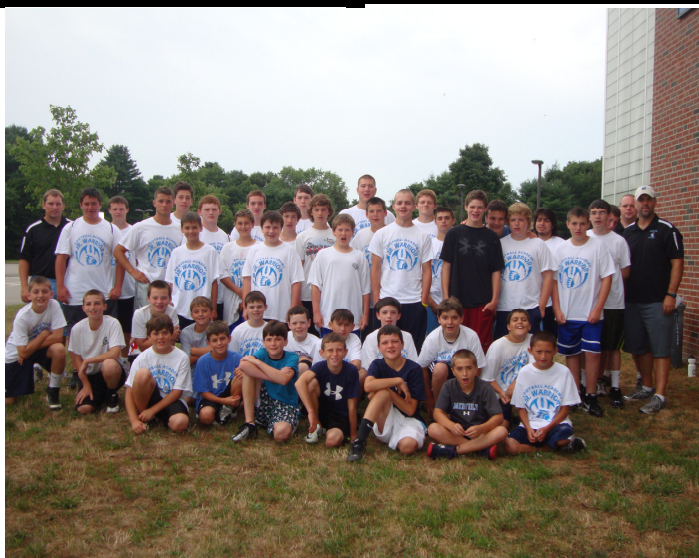
The 2012 edition of Jr. Warrior Academy had 33 campers commit to learning more about football skills

mont on Tuesday, August 28 at 6pm and we will host Franklin High School on Friday, August 31st here at MHS at 11AM.