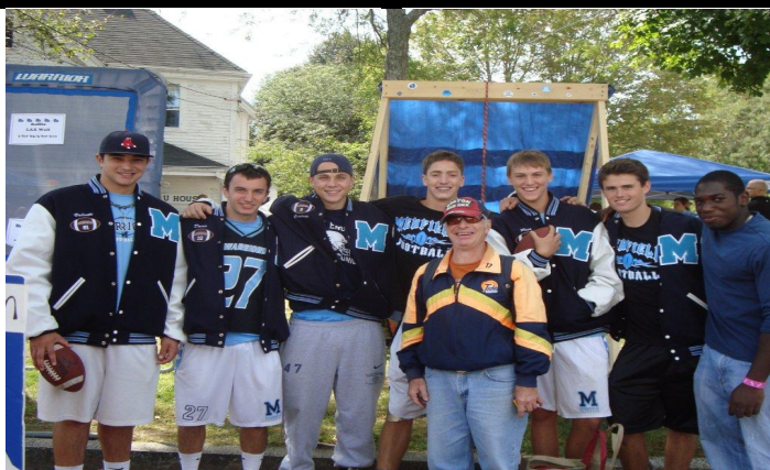
Volunteers from the team at Medfield Day.

I would like to extend a heartfelt thanks to all the parents in the program for their continued, unconditional support of the team. I have learned a lot of lessons in my first year as head coach, none more notable than what goes on behind the scenes.