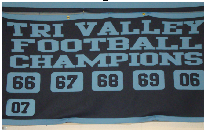
The senior class has been working hard all summer in a collective effort to add to the above banner.